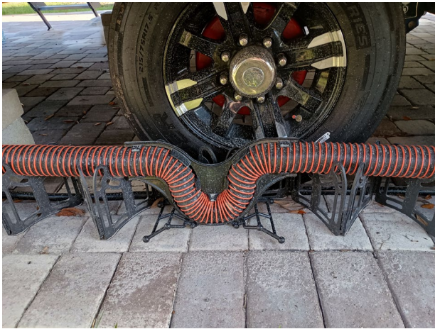
Legs positioned in the “ LOW ” height setting

Pull the sewer hose support away to make room for the Snap Trap. The Snap Trap may be installed at any point within the sewer hose support run. The legs may be omitted as they are not required.