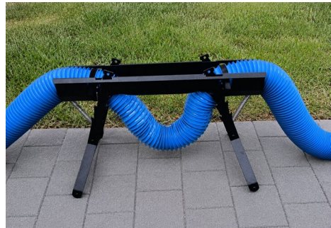
RV Trap Shield in “Stand Alone” use