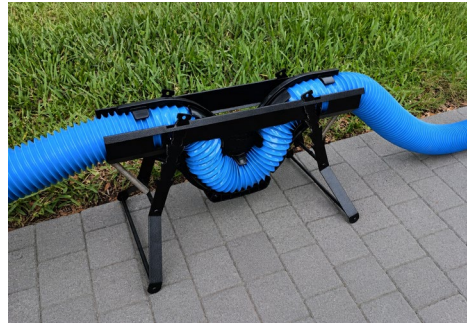
With RV Snap Trap® in “Stand Alone” use