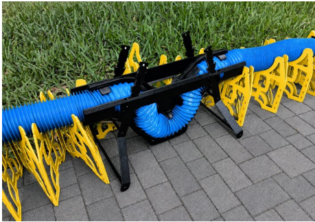
With RV Snap Trap® and Sewer Hose Support